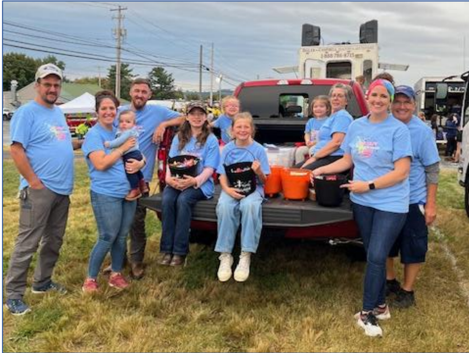
Youth Crew in the Solanco Fair parade. They got a little wet but still had fun!