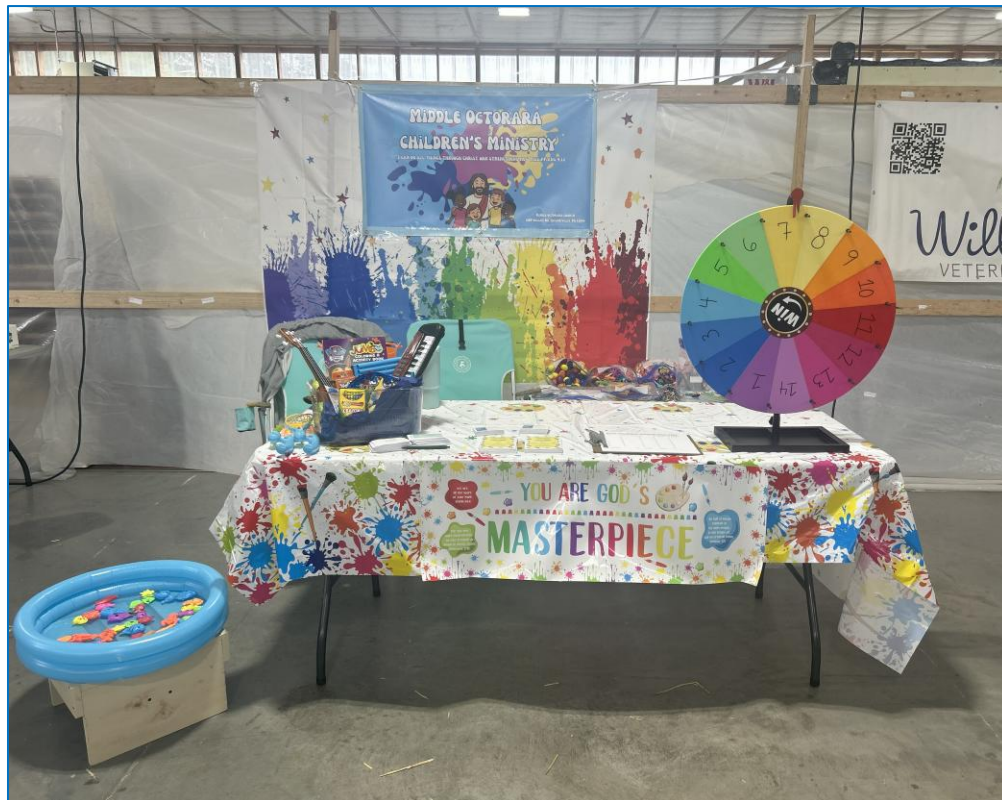
Youth Ministry Solanco Fair Booth